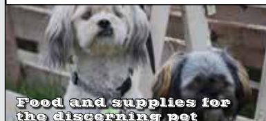
Food and supplies for the discerning pet