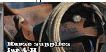
Horse supplies for 4-H

3242 Highway 16 East, PO Box 252, Smithers, BC V0J 2N0 Bus: 250.847.9810 / Fax: 250.847.0199 / Toll-Free: 1.800.860.9840 Email: info@smithersfeedstore.com