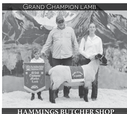
GRAND CHAMPION LAMB