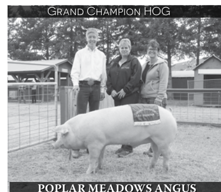
GRAND CHAMPION HOG